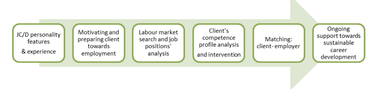
Figure 2. Functional approach to JC/D concept based on SE process

Searching for the simplest concept of KSC for JC/Ds, project partnership have decided to use the functional approach , based on earlier recognized job description of this profession. This kind of approach fits well with the schema of linear stages of SE process enriched by the initial demand for the component "C – competence" (which can be referred to the personality features and experience of the candidate for Job Coach). This proposal is presented in Figure 2.